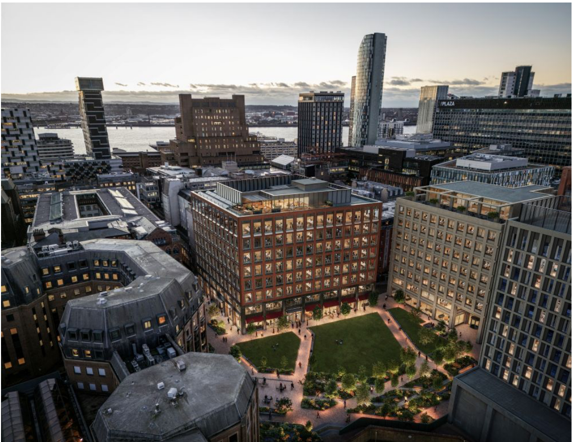
Computer Generated Image of Pall Mall Scheme, Liverpool Commercial District