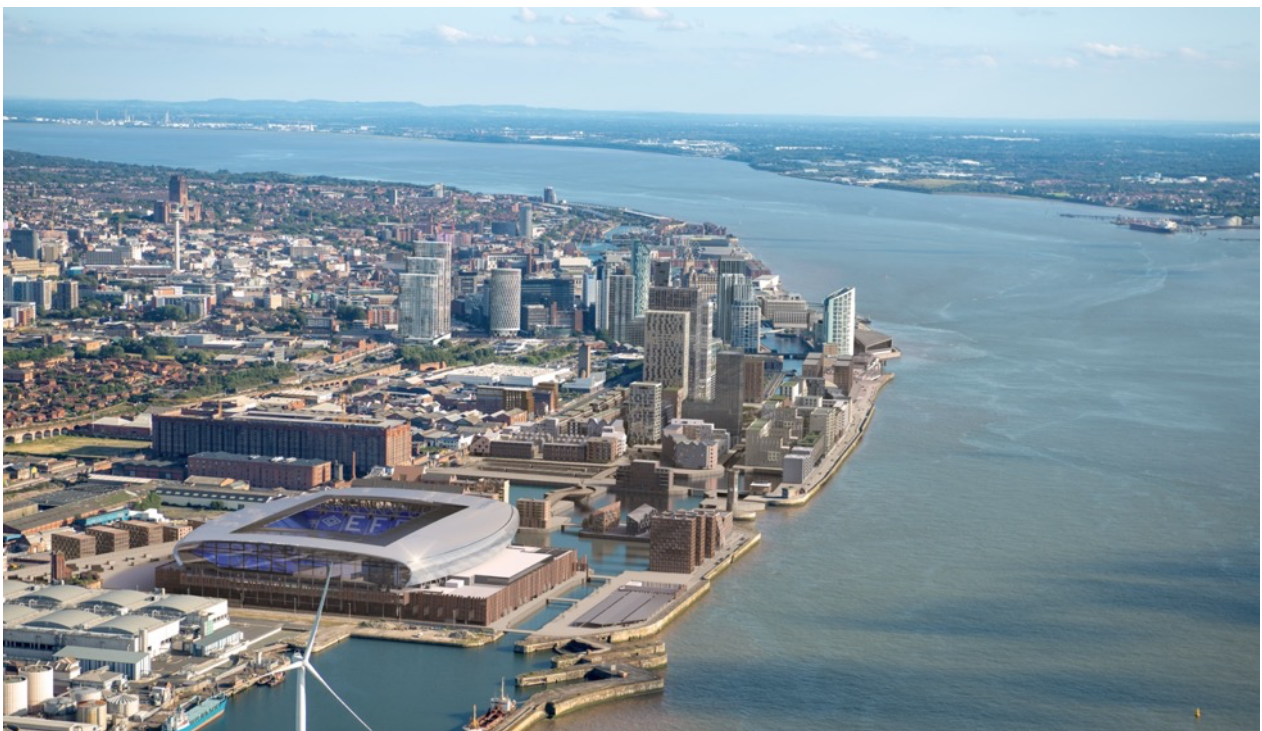
Liverpool Waters – looking south to Liverpool City Centre