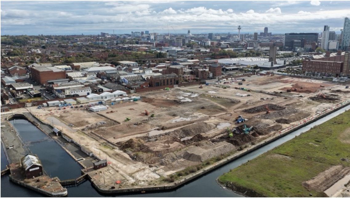
Central Dock, Liverpool Waters