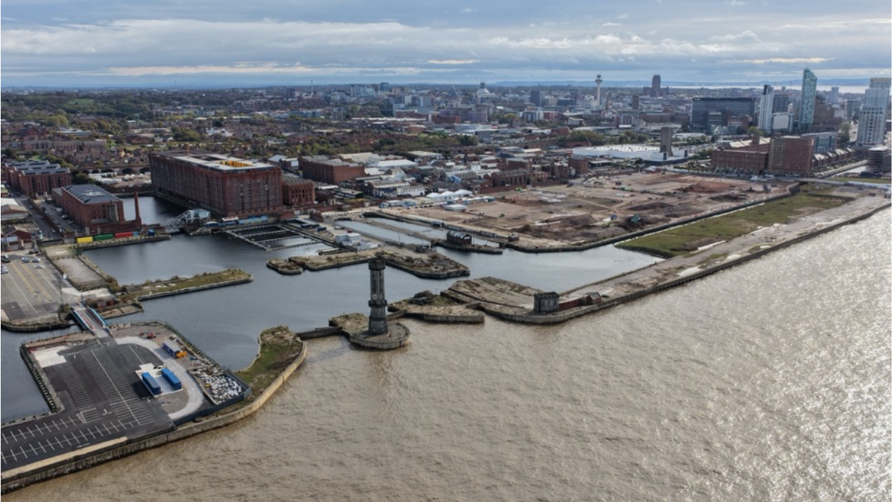
Liverpool Waters towards Liverpool City Centre