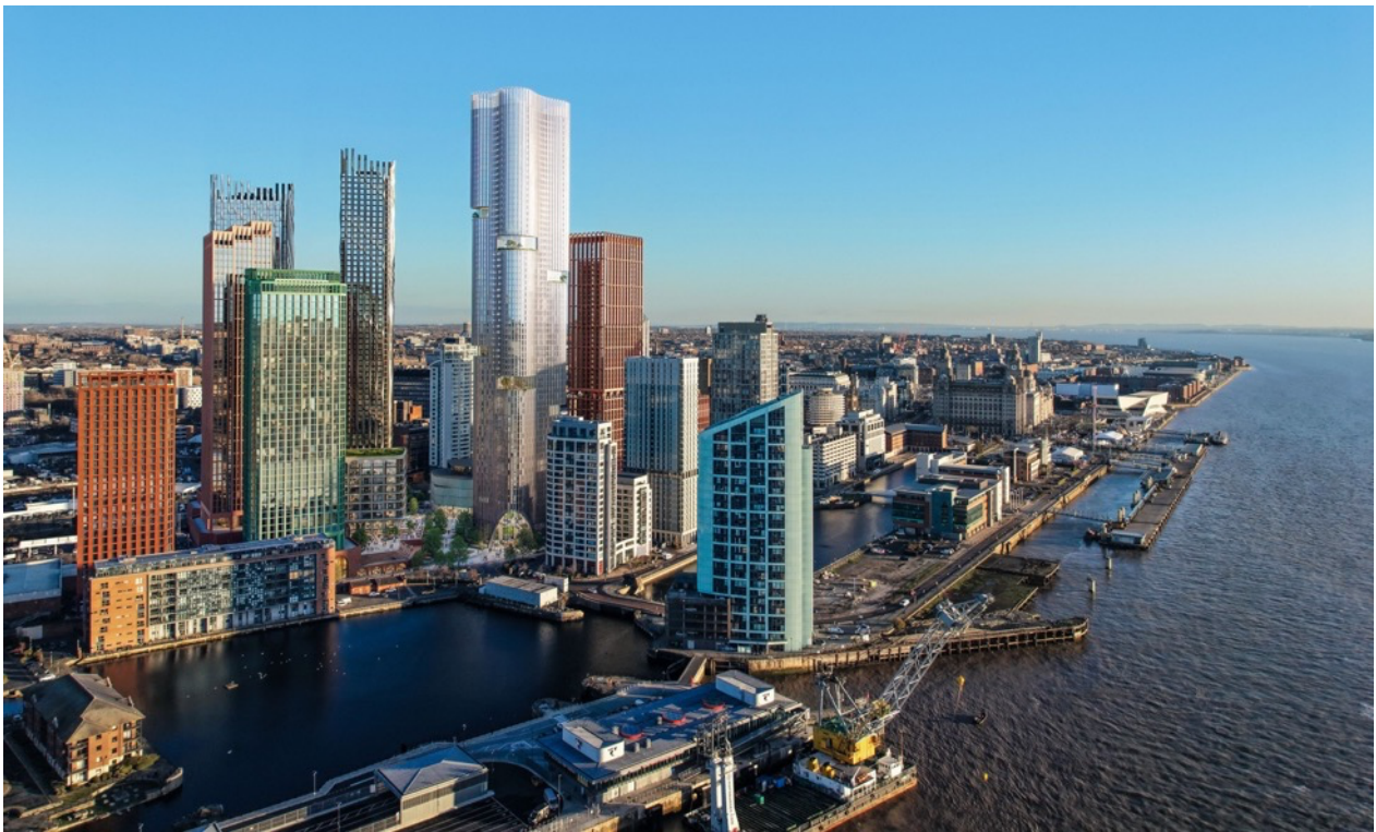
The proposed £1bn Kings scheme, looking south to Pier Head Image Credit: Beetham Davos