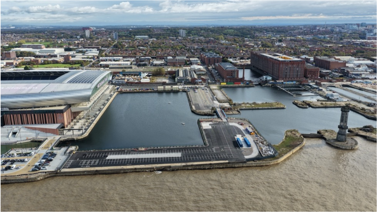
Ariel View, Bramley Moore and Stanley Docks, Liverpool Waters