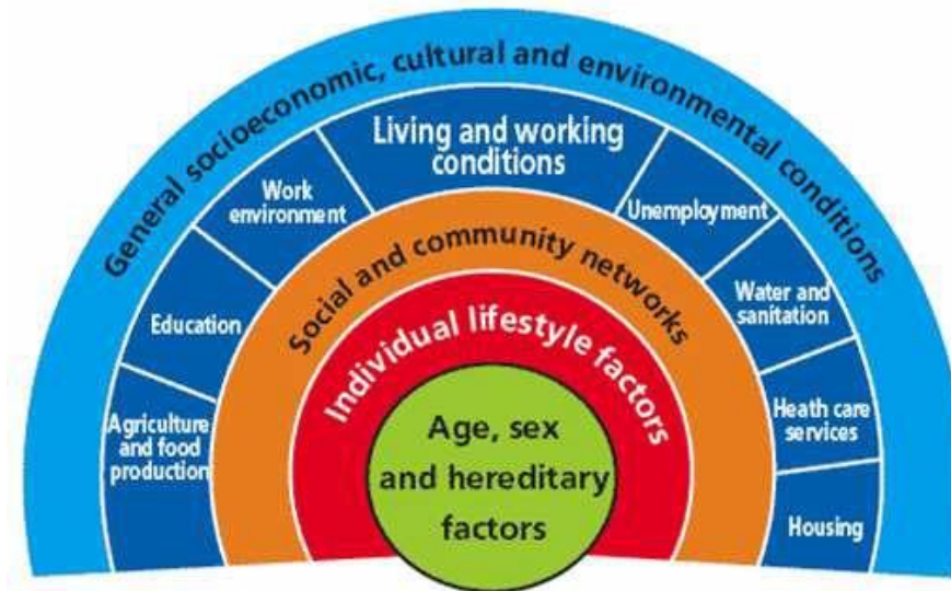
Figure 2-1: The Socio Environmental Model of Health and Wellbeing